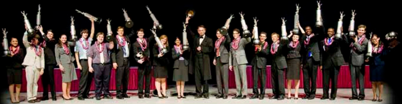
The 2009 "Stars Fell on Alabama" LFG / NFL Circle of Champions.