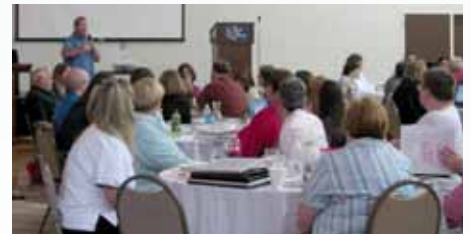
The Summer Leadership Conference was held in Ripon, Wisconsin, in August 2009.